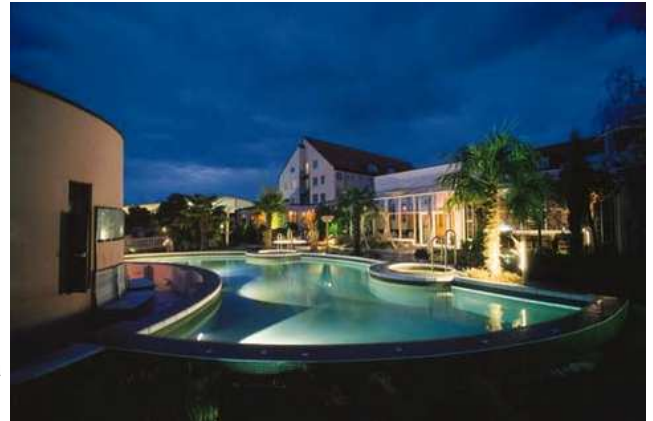
Lindner Hotel & Spa

In cooperation with KRAFTHAND, the popular service centre magazine, AVA Deutschland has initiated a lottery. The main prizes are: 3 weekends for two people in Hockenheim/ Speyer. In Hockenheim, there will be racing action in four different series on the ADAC Masters Weekend and you will find cultural events and relaxation in the Lindner Hotel & Spa in Speyer.