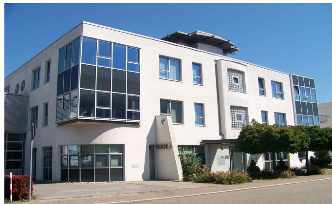
New seat/headquarter of AVA Deutschland GmbH in Gerlingen from Mai 2010

In the beginning of May, the sales department of AVA Deutschland GmbH moved from Berlin to the company headquarters in Gerlingen and a single order management center is established. By the end of May, the stock in Gerlingen is centralized. The market share of the company's thermal products among the German IAM (Independent Aftermarket) is around 10-12%. A purchase of further market shares is not planned. We are focusing on internal development and growth by concentrating on the strongest acquisitions. The consolidation of the brands GERI and AURADIA under the family brand AVA Quality Cooling comes along with the complete organizational integration of the companies.